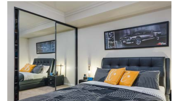
Mirror Panels – 2 door