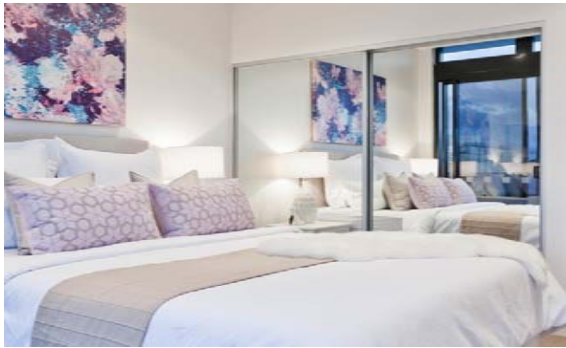
Mirror Panels – 2 door