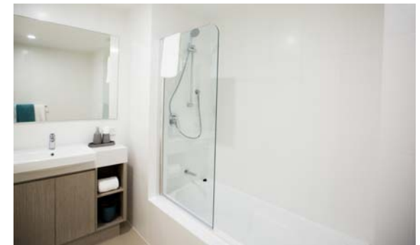
Single Swing Panel Over Bath