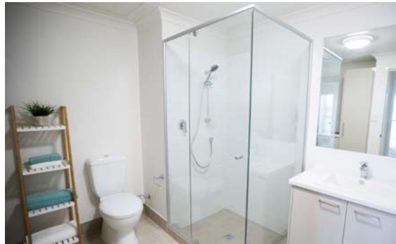
Contour Semi-Frameless Enclosure