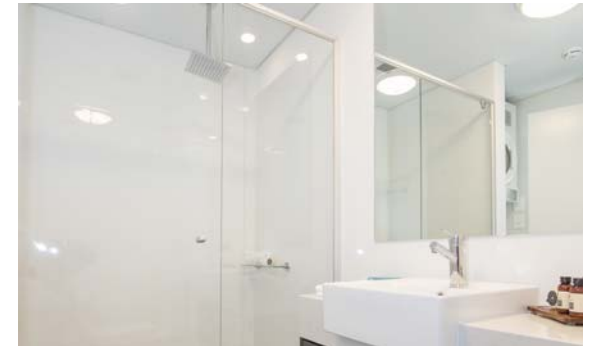
Contour Semi-Frameless Between Walls