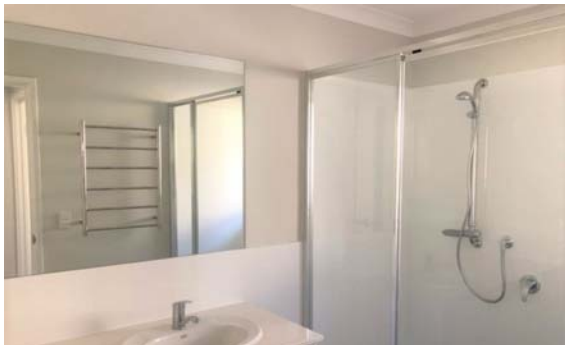
Integrity Fully Framed Between Walls