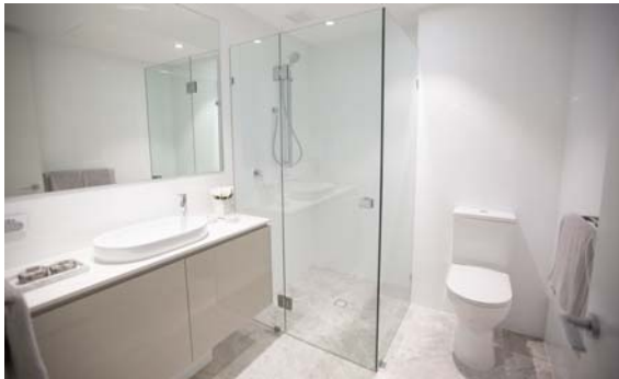
10mm Frameless Enclosure