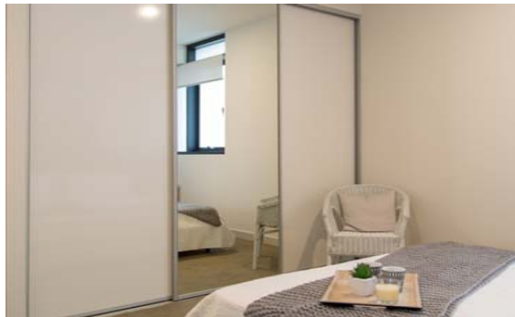
Mirror & Classic White Panels – 3 door