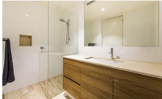
10mm Frameless Fixed Panel