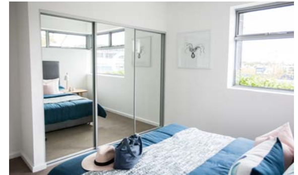
Mirror Panels – 3 door