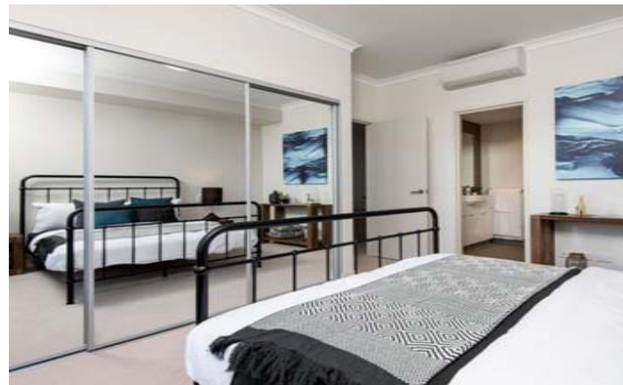
Mirror Panels – 3 door